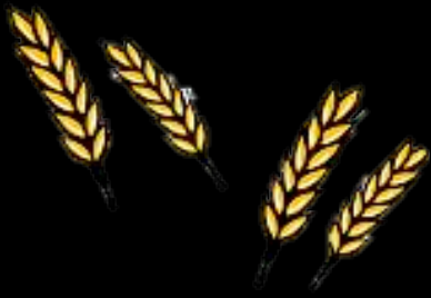
Crop failures and famine

Crops suffered due to drought and disease and starvation was a big problem....People were scared that the devil was at work.