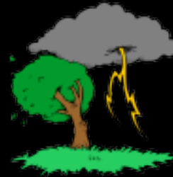
Freak weather conditions