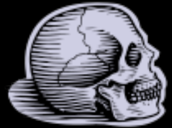
Illness and sudden deaths